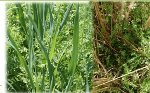
Oats and hairy vetch