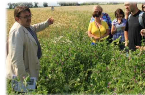
Intensive intercrop mixture N-Fix (DSV ) on the demonstration field